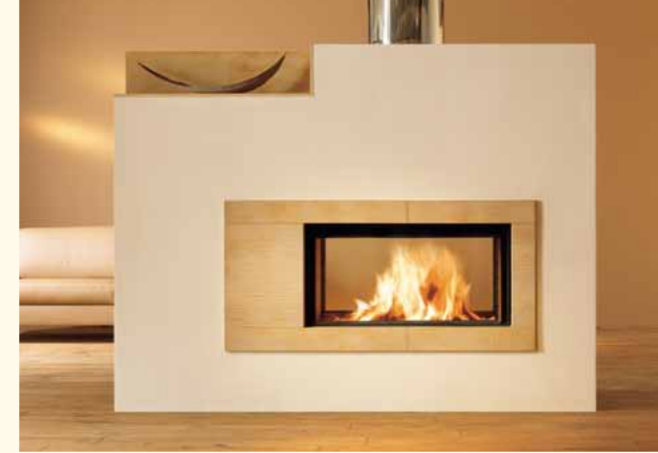
2044_3: fire frame smooth and flute lengthwise 240 Glaze: hemp light Technique: Spartherm KE 137