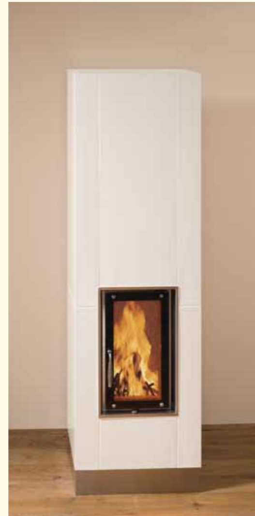
2073: Heat-storing tiled stove, square Glaze: enamel glossy