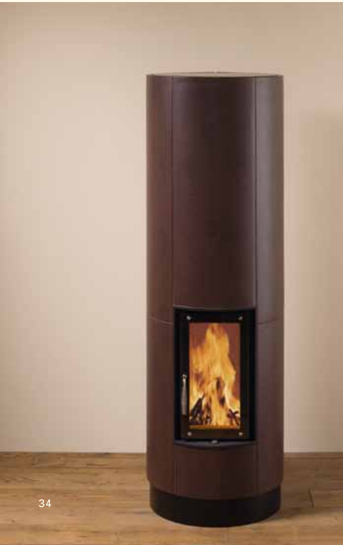
2071: Heat-storing tiled stove, round Glaze: umbra