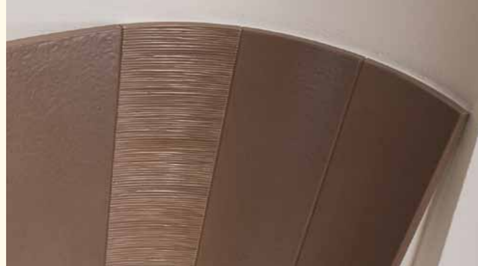
2064: backrest smooth and flute fine 378, slab cornice and flute fine 178 Glaze: basalt medium, alabaster matt Technique: Brunner Kompakt-Kessel water boilers KE 283

The tiled stove as a heating system for the whole house has a long tradition. This type of tiled stove can also heat water and fosters independence by making use of a domestic raw material - wood. Well-being is included when you nestle up to our stoves.