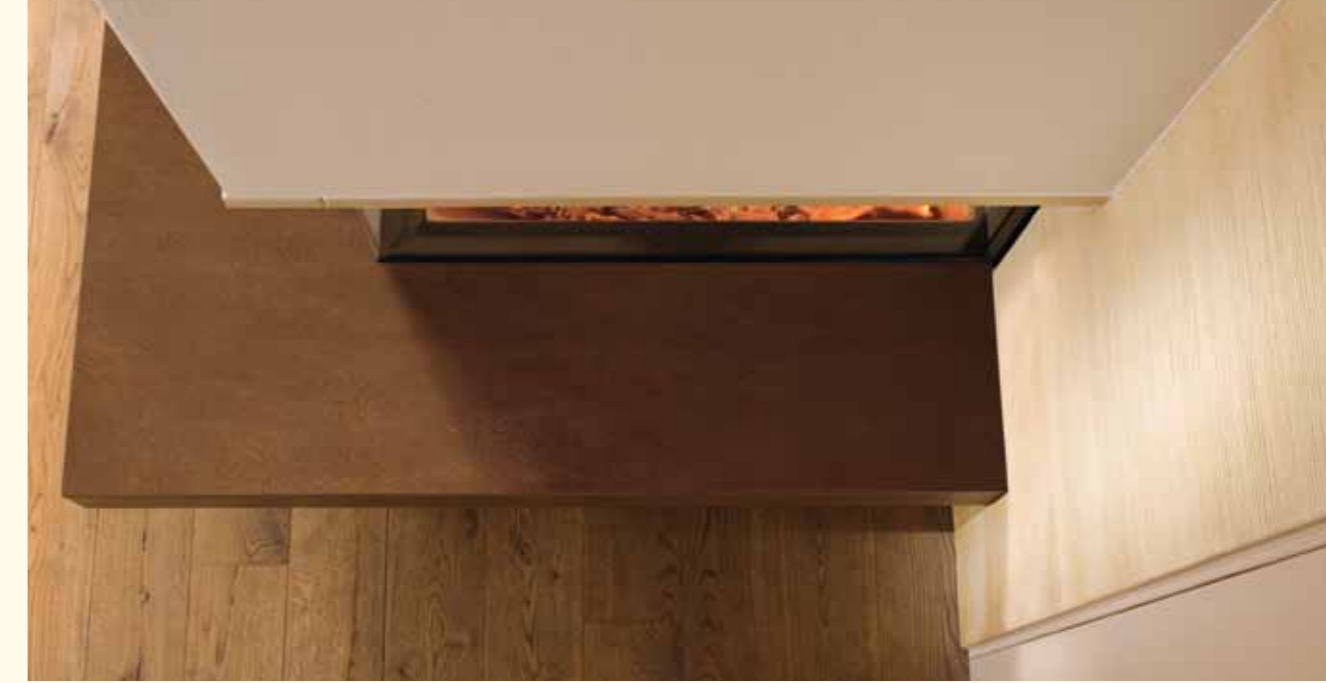
2057: fire shelf MAXIMUS 179, fire tiles MAXIMUS flute lengthwise 241 Glaze: rust, solnhofen Technique: Spartherm KE 350

True greatness depends on generosity. Fascinated by the idea of designing a generous fireplace in a special room, the Ceramic Manufactory Sommerhuber developed the fire shelf MAXIMUS. One single piece of ceramic, the perfect material to give the fire a convenient frame - just like a monolith.