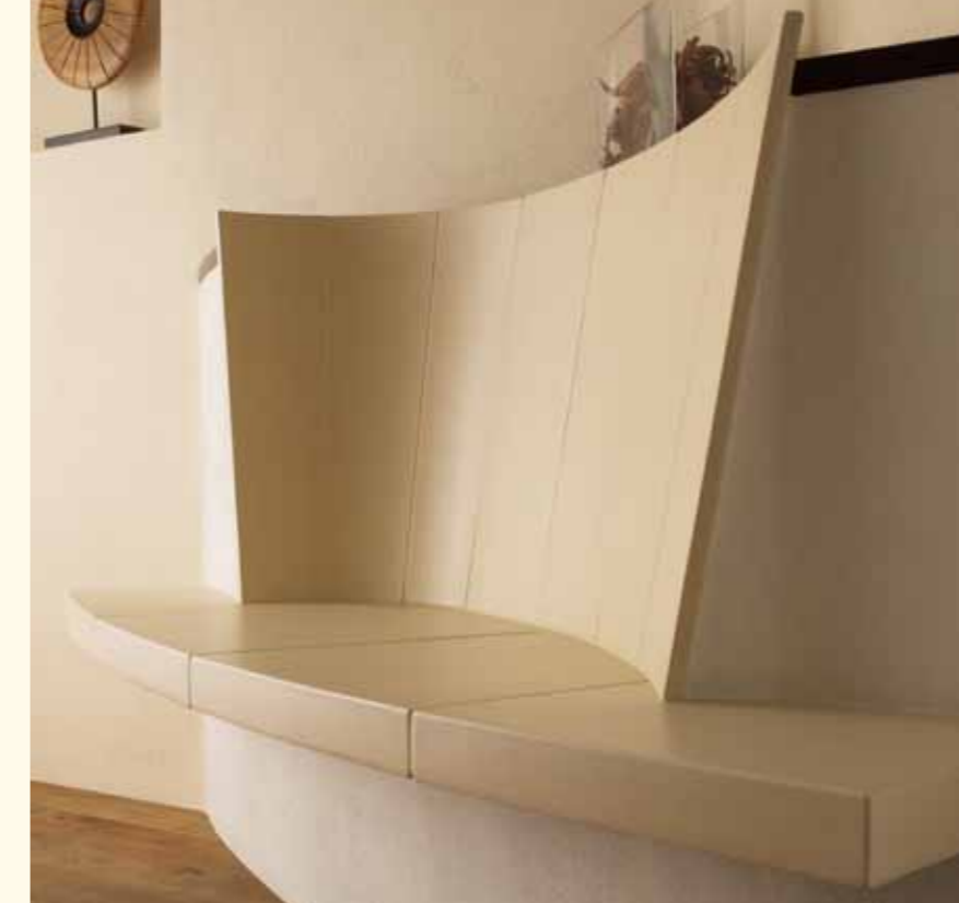
2047_1: backrest 378, fire shelf 179 Glaze: cocoa dark, perla Technique: Brunner KE 351

Tiles have particular qualities. They store heat and release it in the form of particularly gentle, healthy ceramic radiant heat. Heat which has long since been known for its healing, relaxing effect on our body. Beneficial and relaxing, this is the quality of tiles by Sommerhuber.