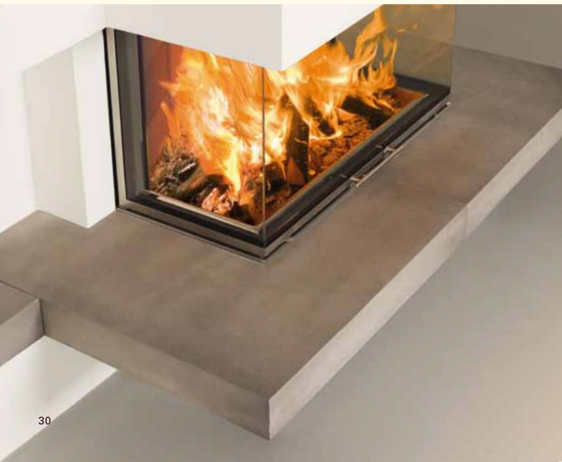
2061: fire shelf 179, niche 284 Glaze: granite light Technique: Spartherm KE 219

An open fire signifies a natural unity of the familiar and the fascinating which satisfies our desire for warmth and comfort. The reinterpretation of open fire with modern design, surfaces and glazes which are adapted to the modern style.