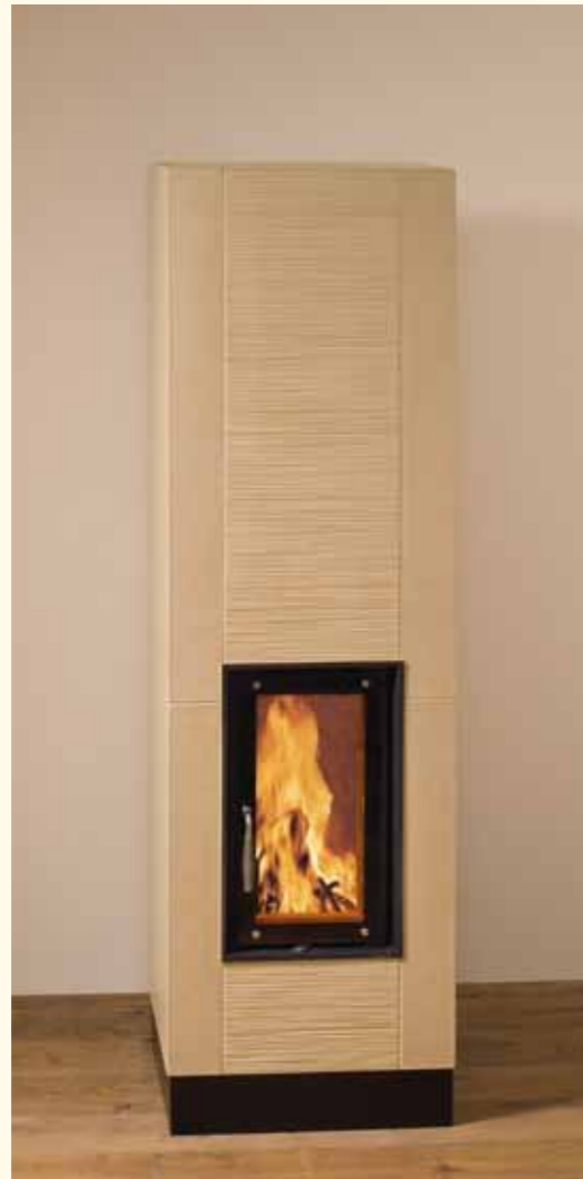
2072: Heat-storing tiled stove, square Glaze: sahara